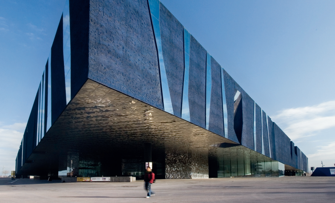
Conference Center, Main Building